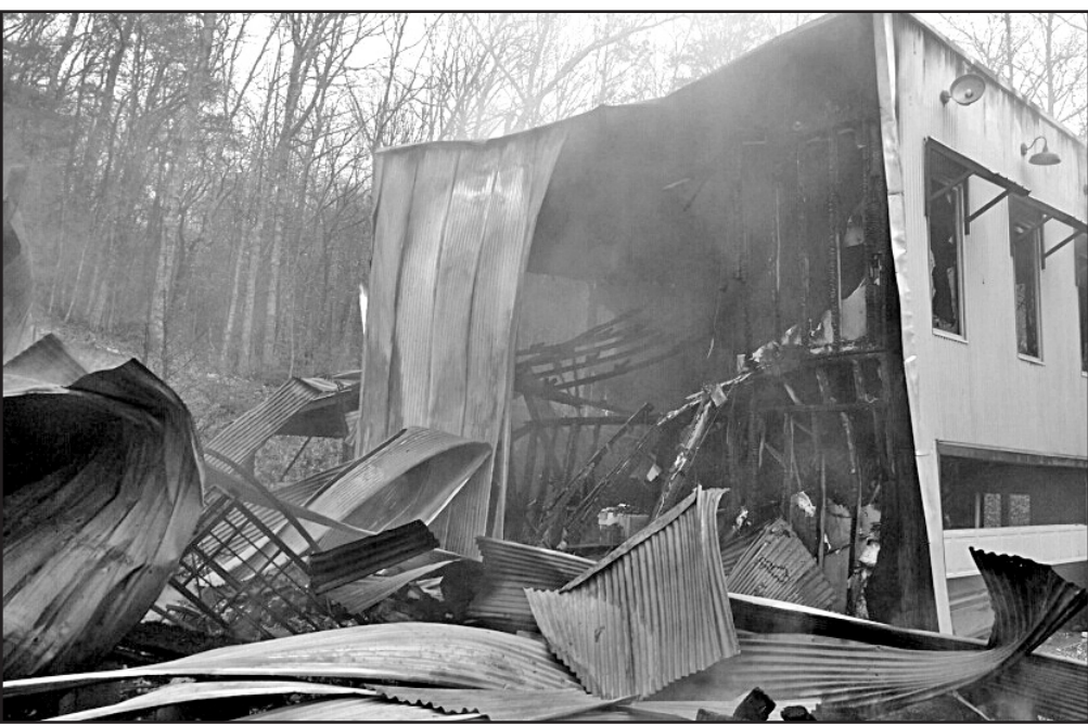
Fortunately, no one was home.

Service was talking Tuesday about Wednesday, and they were pretty serious about it.”