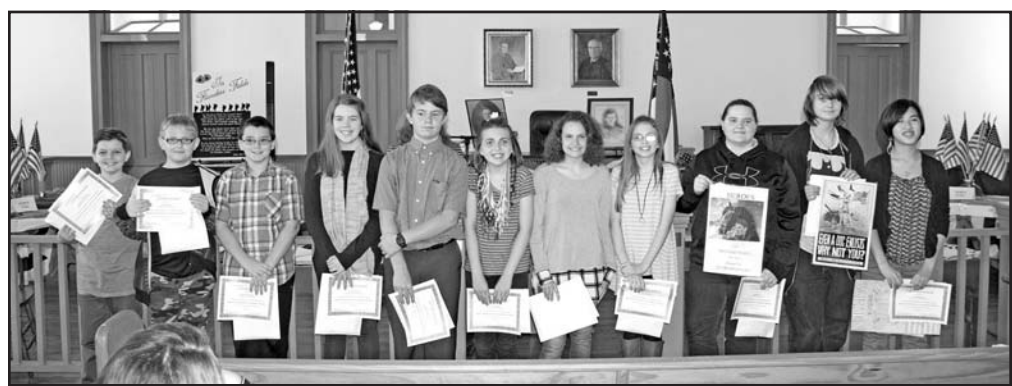
The event featured students from Union County Primary, Middle and High Schools, plus Woody Gap School

World War I began on July 28, 1914, and ended on Nov. 11, 1918, after the armistice signing between the Allied Forces and Germany, in Compiègne, France.